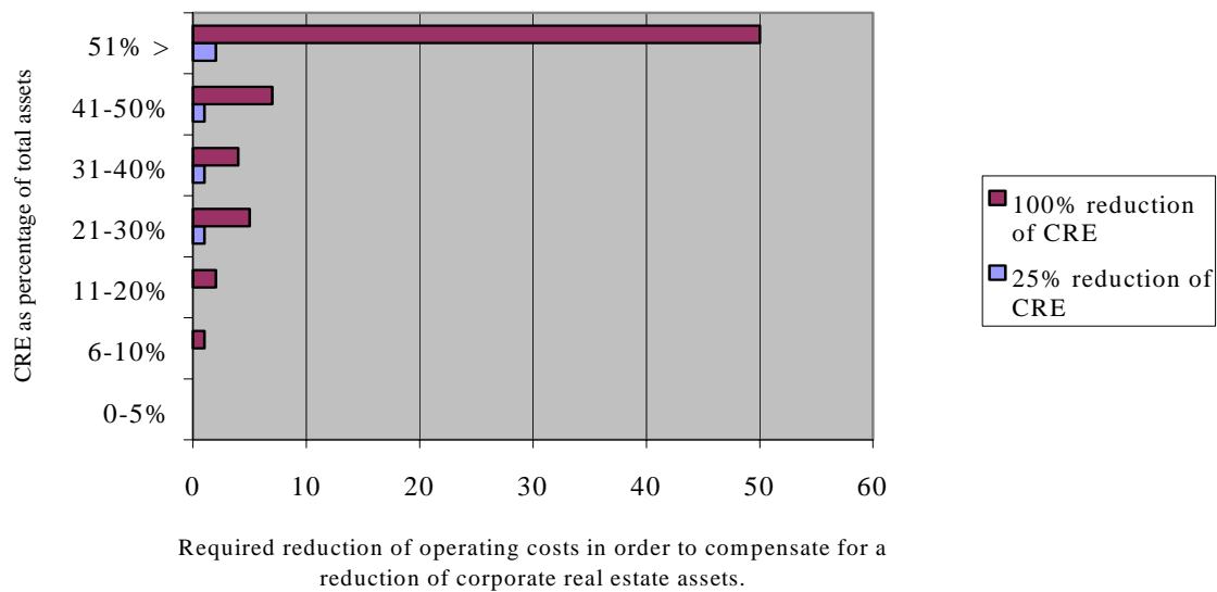
Figure 2: Required expense and cost improvement in order to compensate for real estate reduction

A comparison of the effects of asset reduction and the required profit improvements which are necessary to achieve equal value increases enables corporations to make a deliberate choice between allocating resources to reducing assets or to improving revenues or cost of sales and expenses. The required revenue/cost improvements increase when there is a radical reduction, or if real estate is a considerable percentage of the total assets. Figure 2 shows the required reduction of operating cost in order to compensate for two scenarios: 100 percent reduction of CRE, and 25 percent reduction of CRE. The effects are influenced by the percentage of real estate assets compared to the total corporate assets. Although the required sales/cost activity might appear to be small, most corporations would be happy to realize a revenue growth rate of 3 percent (e.g. Philips Electronics) or 7 percent (e.g. Unilever) versus results of 1 percent for a 25 percent real estate asset reduction.